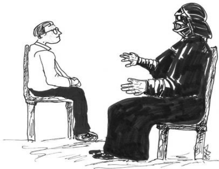
DARTH VADER’S FIFTH STEP

“I pulverized Planet Alderaan, tried to lure my son to the Dark Side, destroyed Garrison Moon of Kessel...”