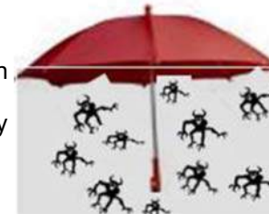
Demons of Obsession

were work that interfered with my partying (which consisted of drinking in front of the TV). I knew I could not continue to live the way I'd been living. Death actually seemed the easier option.